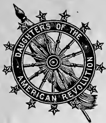
OFFICIAL EMBLEM (Actual Size)